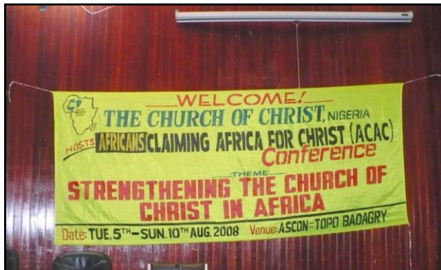
The ACAC-NIGERIA 2008 Banner